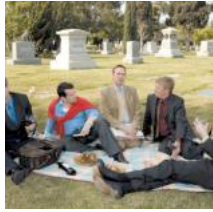
Comedy: The best (and worst) of 2008