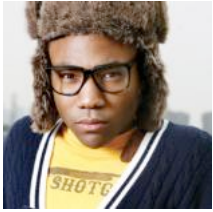
Best (and worst) of 2009